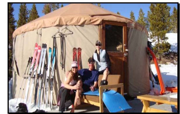
A relaxing day at the Ridge Yurt!

For more information about the Bear River Outdoor Recreation Alliance, the Wasatch-Cache National Forest, the Lily Lake trail system, and yurts, please visit www.broryurts.org .